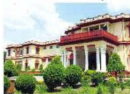
Bharat Kala Bhawan