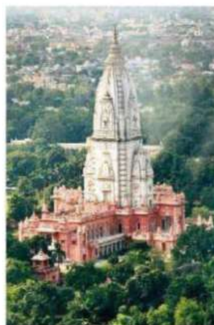
Shri Vishwanath Temple

BHU is the first Central University in India which has implemented a 'Graphic Identity Programme'. Through this programme, BHU has standardized its seal, logo, bilingual logotypes, tagline, colour identity etc. This programme also includes standardization of office stationery and signage system of the campus through its Design Studio, Souvenir shop, Electronic, Web & Social media.