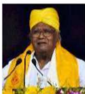
99 th Convocation – 2017 Bharat Ratna Prof. C.N.R. Rao, FRS