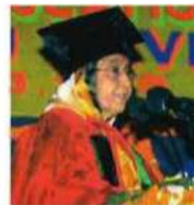
91 st Convocation – 2009 Hon'ble President of India Smt. Pratibha Devi Singh Patil