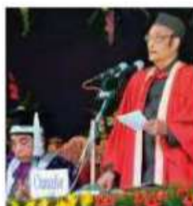
95 th Convocation – 2013 Hon'ble Chancellor of BHU Dr. Karan Singh