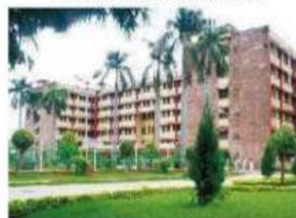
Sir Sunderlal Hospital