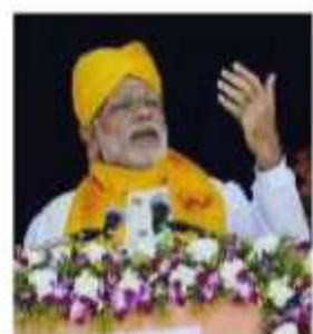
98 th Convocation – 2016 Hon'ble Prime Minister of India Shri Narendra Damodar Das Modi