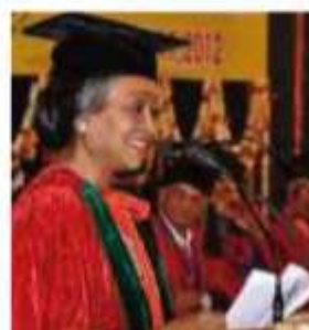
94 th Convocation – 2012 Hon'ble Speaker of Lok Sabha Smt. Meira Kumar