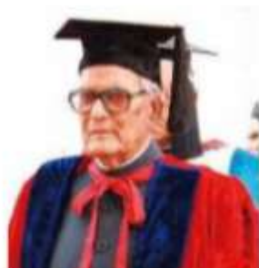
89 th Convocation – 2007 Hon'ble Vice-President of India Shri Bhairon Singh Shekhawat