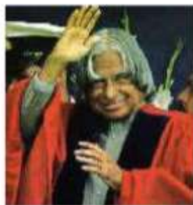
88 th Convocation – 2006 Hon'ble President of India Dr. APJ Abdul Kalam