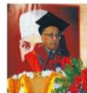
Special Convocation – 2012 Hon'ble President of India Shri Pranab Mukherjee