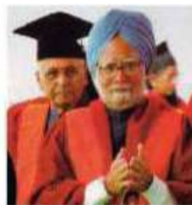
90 th Convocation – 2008 Hon'ble Prime Minister of India Dr. Manmohan Singh