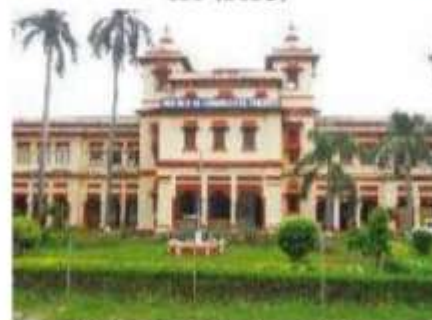
Institute of Agricultural Sciences