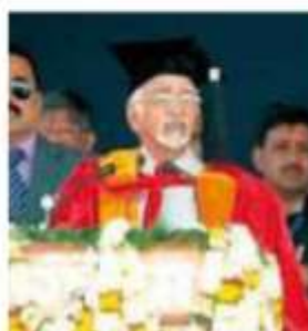
92 nd Convocation – 2010 Hon'ble Vice-President of India Shri Hamid Ansari