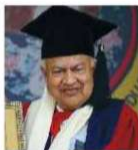
96 th Convocation – 2014 Padma Vibhushan Prof. Jayant Vishnu Narlikar