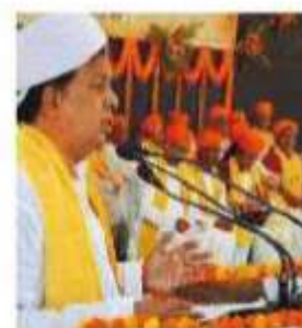
97 th Convocation – 2015 Padma Vibhushan Dr. G. Madhavan Nair