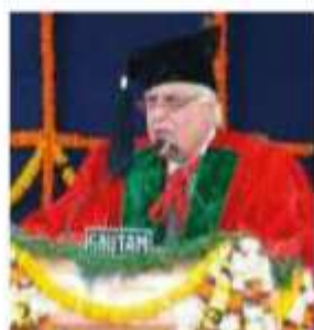
93 rd Convocation – 2011 Hon'ble Minister of HRD Shri Kapil Sibal