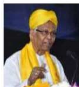
100 th Convocation – 2018 Padma Vibhushan Dr. Raghunath Anant Mashelkar, FRS