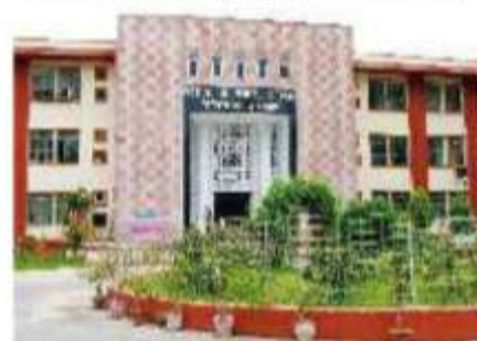
Institute of Medical Sciences