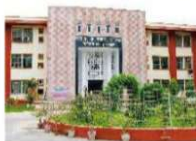
Institute of Medical Sciences