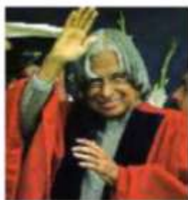
88 th Convocation – 2006 Hon'ble President of India Dr. APJ Abdul Kalam