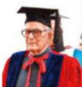
89 th Convocation – 2007 Hon'ble Vice-President of India Shri Bhairon Singh Shekhawat