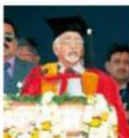
92 nd Convocation – 2010 Hon'ble Vice-President of India Shri Hamid Ansari