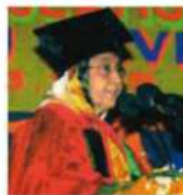
91 st Convocation – 2009 Hon'ble President of India Smt. Pratibha Devi Singh Patil