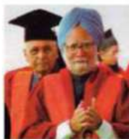
90 th Convocation – 2008 Hon'ble Prime Minister of India Dr. Manmohan Singh