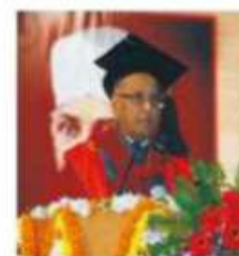
Special Convocation – 2012 Hon'ble President of India Shri Pranab Mukherjee