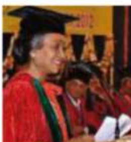
94 th Convocation – 2012 Hon'ble Speaker of Lok Sabha Smt. Meira Kumar