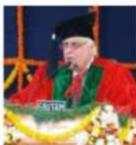
93 rd Convocation – 2011 Hon'ble Minister of HRD Shri Kapil Sibal